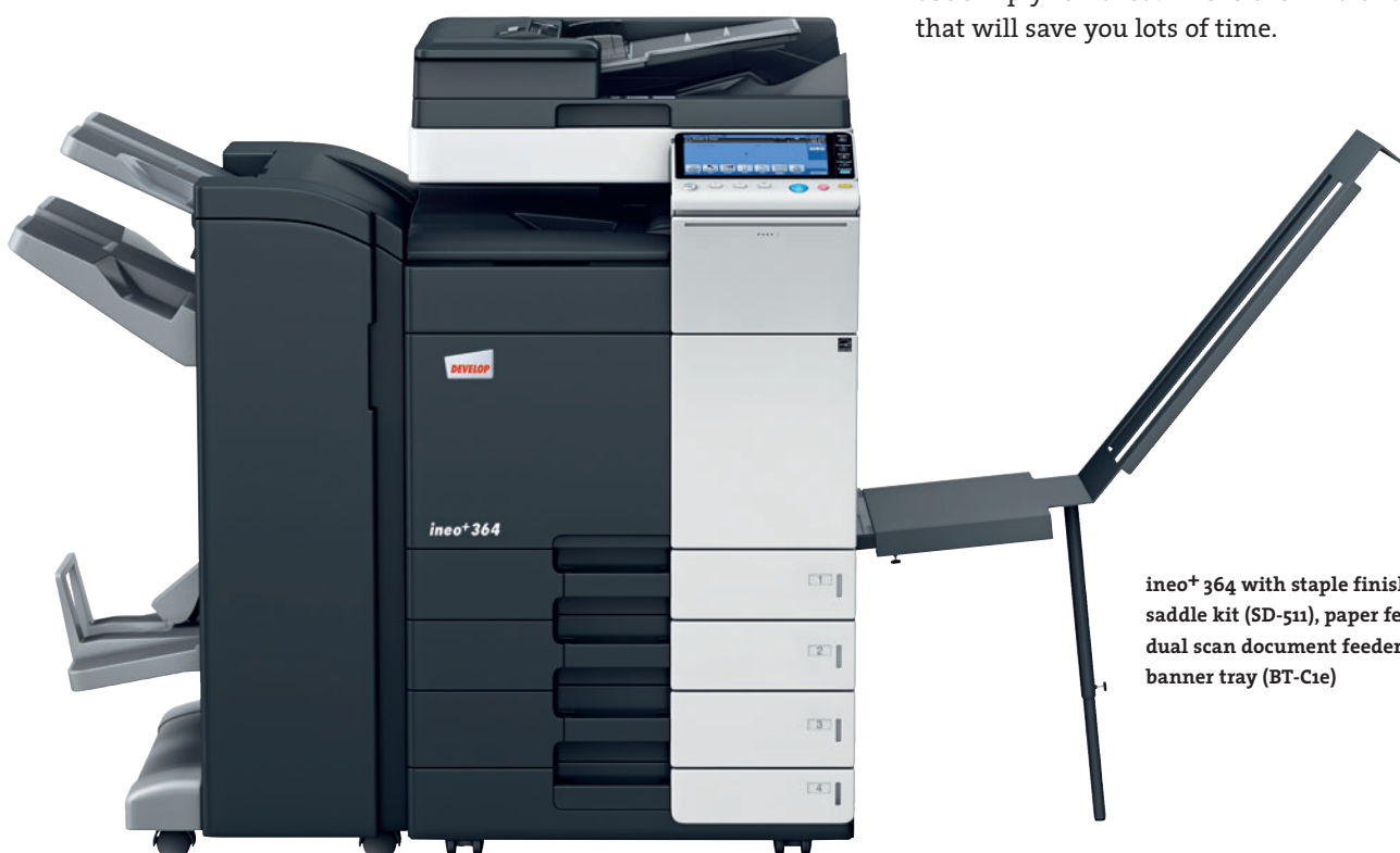
ineo+ 364 with staple finisher (FS-534), saddle kit (SD-511), paper feeder (PC-210), dual scan document feeder (DF-701), banner tray (BT-C1e)

Many multifunctional office systems are anything but user-friendly. The ineo+ 364, in contrast, is simplicity itself. An intuitive, easily understandable operating concept ensures that it is as easy to use as your smartphone or tablet. The 9-inch capacitive touchscreen comes with well-known functions such as flick&drag, and thanks to a new menu navigation structure you can see all functions in one go and select the settings you want with just a few clicks. Frequently used functions can be left on the start screen and ones you don't use simply removed. This is the kind of customisation that will save you lots of time.