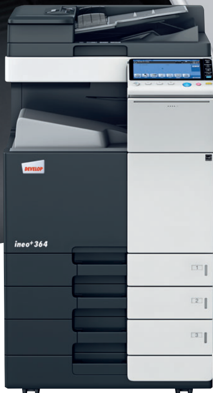
ineo+ 364 with paper feeder (PC-110) and dual scan document feeder (DF-701)